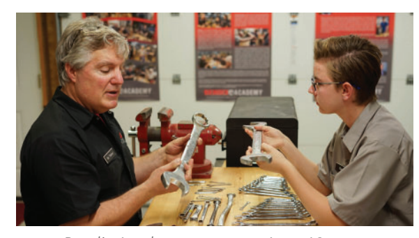
Bendix Academy programs Ages 12 + up